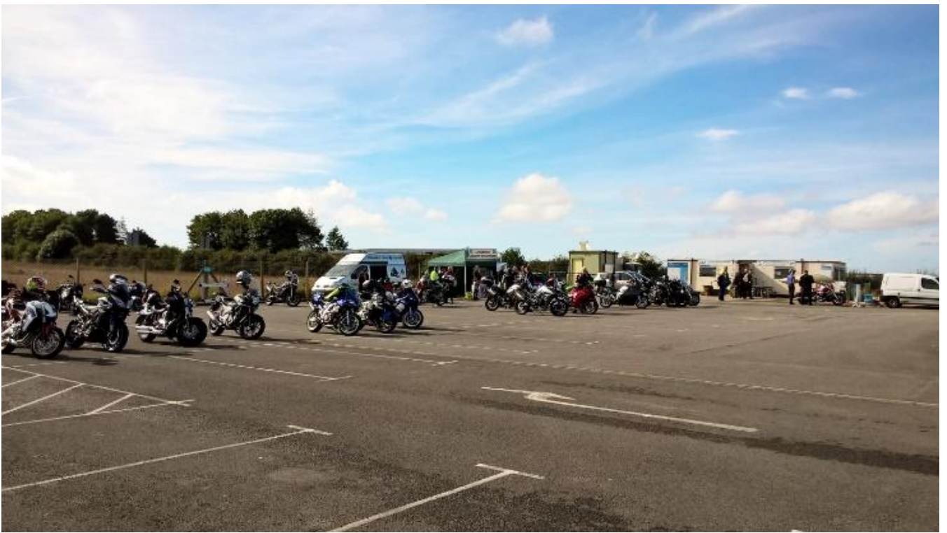
Lincolnshire Advanced Motorcyclists at the Waddington Airfield Event on 11 th September

THE NEWSLETTER OF THE LINCOLNSHIRE ADVANCED MOTORCYCLISTS IAM GROUP 7176, REGISTERED CHARITY 1049955, SUPPORTERS OF THE BMF