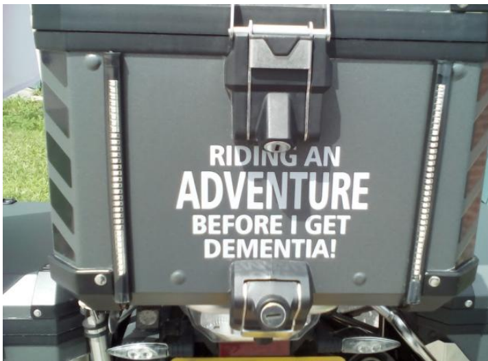
BMW GS1200 top box on run

We left the fire training college pretty much on time and headed south into the Cotswolds through many chocolate box villages. The sight of 50+ bikes snaking through the countryside was quite something, a shared experience unlike pretty much anything else I have done. We then rode across the North Wessex Downs AONB with more chocolate box villages and the weather holding up with cloudy sunshine. After about 90 minutes of riding we arrived at the Army Aviation Centre near Middle Wallop for a comfort break. Plus an opportunity to top up on tea, coffee and bacon butties!