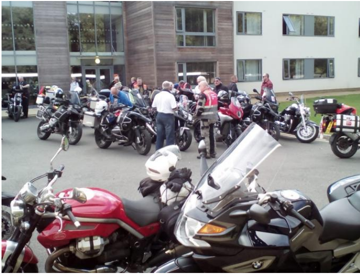
Bikes assembling at registration