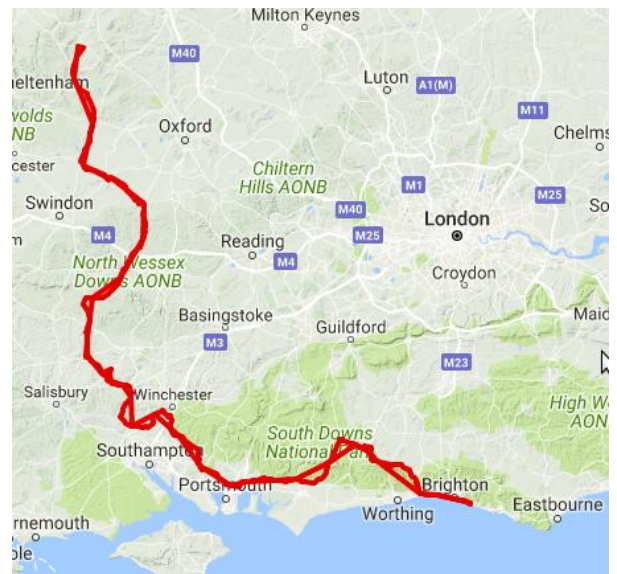
Route from Moreton to Brighton

We then skirted just south of Winchester skirting the southern edge of the south Downs National Park heading towards Fort Widley just outside Portsmouth to pick up some more riders before the final run into Brighton.