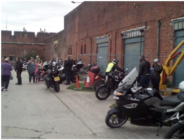
Fort Widley stopover near Portsmouth