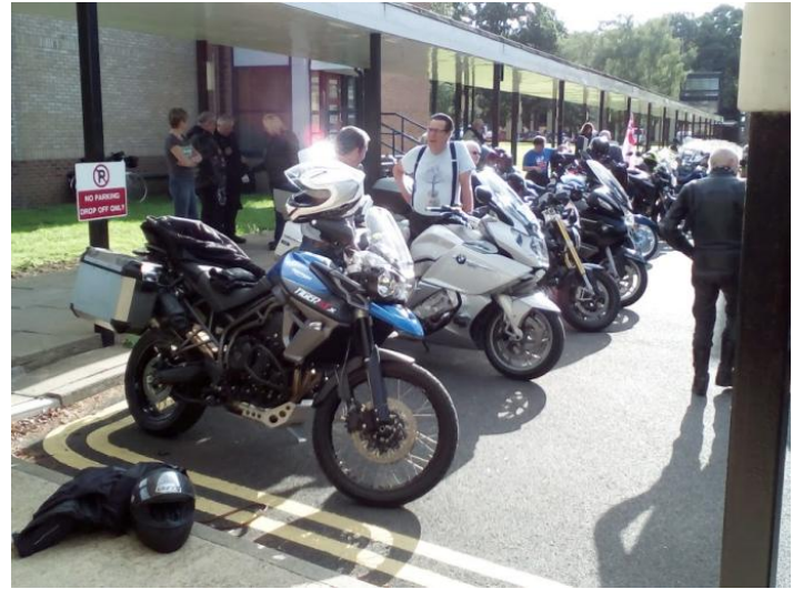
More bikes at registration including my tiger in the foreground and my riding buddies sheltering in the shade in the background.

We left the fire training college pretty much on time and headed south into the Cotswolds through many chocolate box villages. The sight of 50+ bikes snaking through the countryside was quite something, a shared experience unlike pretty much anything else I have done. We then rode across the North Wessex Downs AONB with more chocolate box villages and the weather holding up with cloudy sunshine. After about 90 minutes of riding we arrived at the Army Aviation Centre near Middle Wallop for a comfort break. Plus an opportunity to top up on tea, coffee and bacon butties!