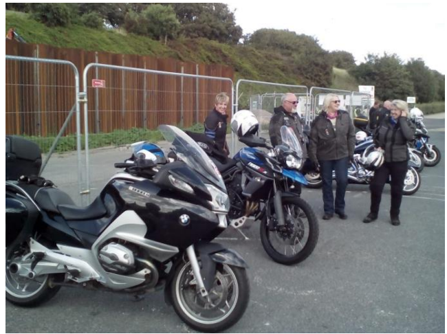
Riding Buddies and Bikes assembling before Brighton Sea Front run to Blind Vets HQ

Then another relatively short ride skirting the south coast until we met up in a lorry park in between Worthing & Brighton for the final massed run to the Blind Vets HQ. The 70 or so bikes all managing to get split up by the many traffic lights on Brighton seafront. Eventually arriving at Ovingdean at 4:30pm