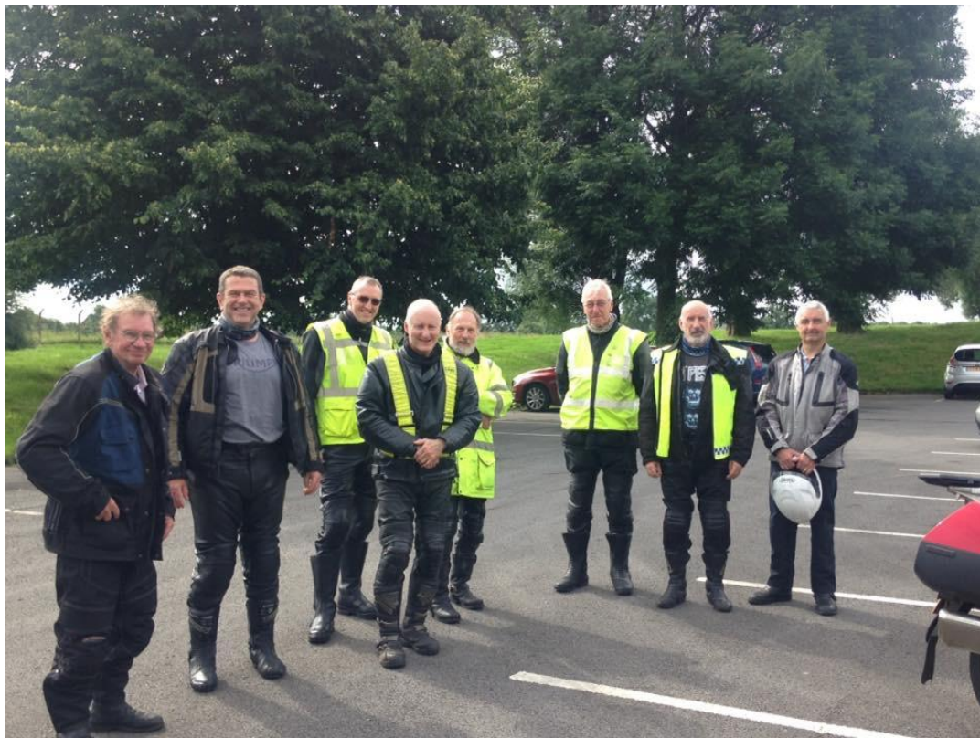
Sunday morning ride out from Brigg Leisure Centre

THE NEWSLETTER OF THE LINCOLNSHIRE ADVANCED MOTORCYCLISTS IAM GROUP 7176, REGISTERED CHARITY 1049955, SUPPORTERS OF THE BMF