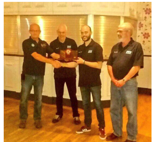
LAM members subbing for Grimsby and Louth car group

The event was supported by members and partners from all the groups.