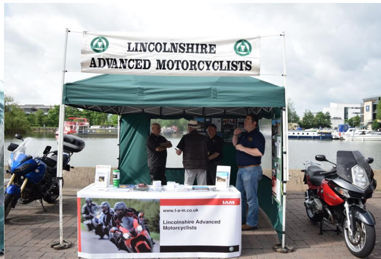
Talking the talk!