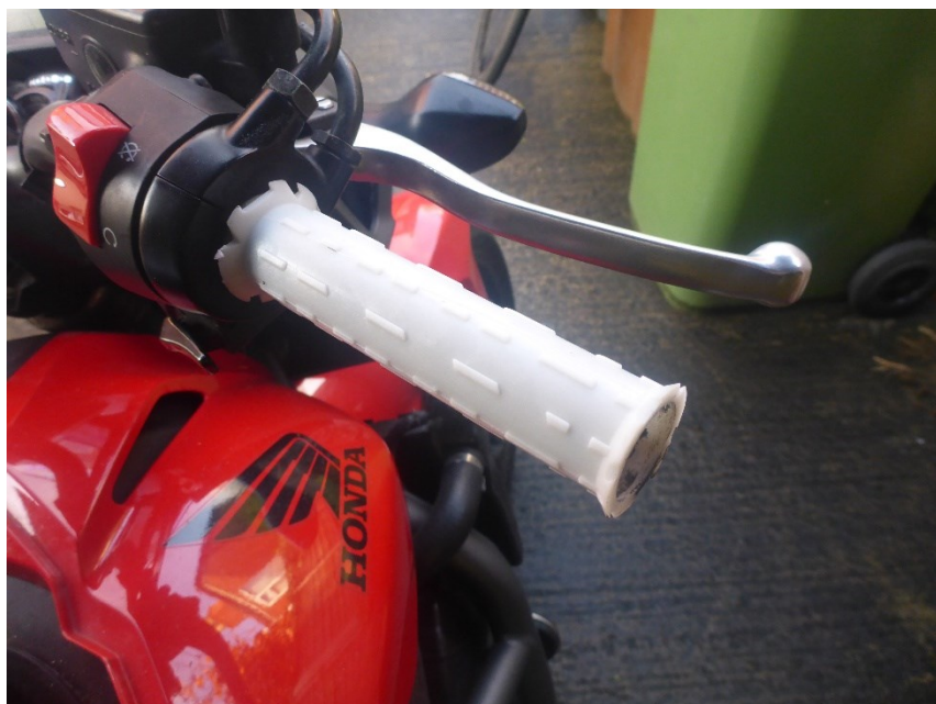
FIGURE 3 TWIST GRIP BEFORE FETTLING

The wiring is simple (see Figure 2 – the diagram shows the advanced model with different wiring connectors but same layout).