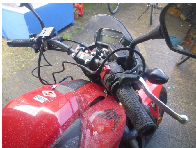
FIGURE 4 TRIAL FITTING – NOTE SNOW EFFECT

The wires are zip tied to the bars and existing cabling (Figure 5). As to performance, the blurb tells us that that maximum draw is 4 amps, so 48 watts for both grips, and 24 watts each. They get uncomfortably hot to hold with a bare hand, so this bodes well for an end to winter numbness. Oh, and the sticker supplied doesn't come off the backing paper, so a small area of the tool chest will remain unadorned.