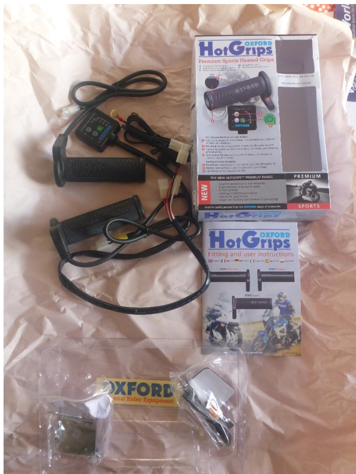
FIGURE 1 WHAT YOU GET

Jolly Santa dropped me a set of Oxford heated handlebar grips down the chimney. This is what you get in the package. These are the Sports Grip option – the difference between the sports, touring and