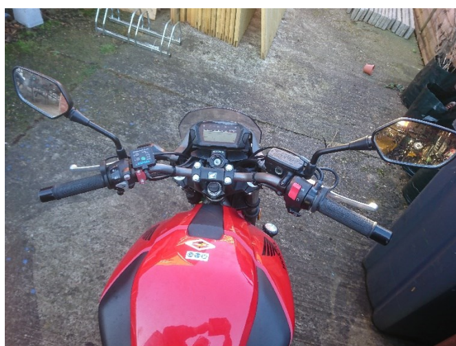
FIGURE 5 TIDIED UP