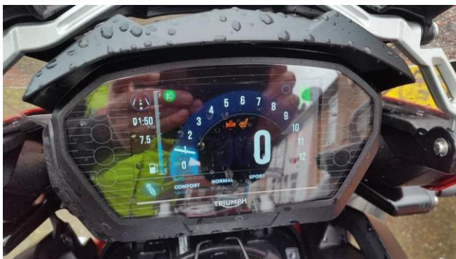
The colour screen is very clear

See also http://coabab.com/triumph-tiger-xrt-1200-road-test/