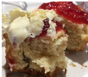
Figure 1 A cake, pictured yesterday