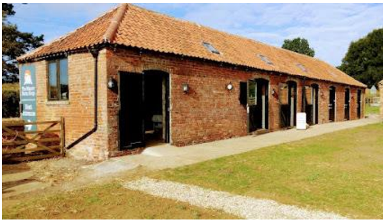
The Manor Farm Shop - Spilsby